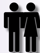
Men &amp; women